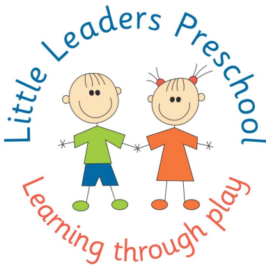
Photo Release Form

Please be advised that your child/children may be photographed or videotaped at various school events.